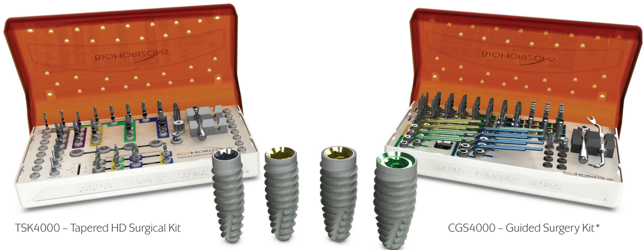
TSK4000 – Tapered HD Surgical Kit

BioHorizons Tapered Pro implants can be placed with the existing freehand and guided surgery kits. The surgical kits include the instrumentation required for Tapered Pro, Tapered Plus, Tapered Internal and Tapered Tissue Level implants.